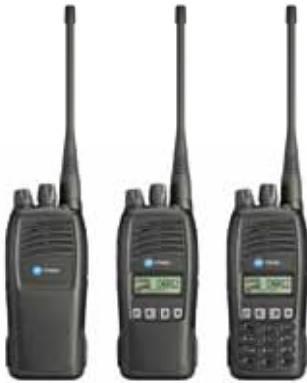
TP8110 TP8115/35 TP8120/40