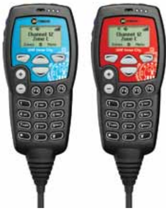
Custom lenses allow easy identification of multiple radios in the same vehicle*